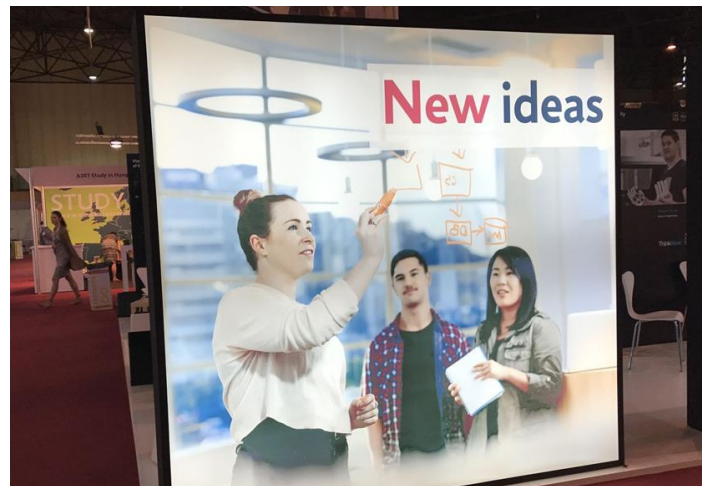
Sample Photos NZ Pavilion NAFSA 2016/17